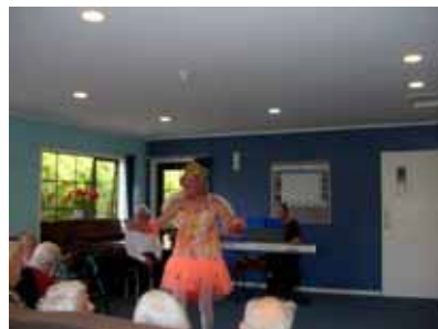
The Little Fairy at the Bottom of the Garden

On Friday 17 August at 1.30pm a wonderful troupe called "Regency Review" came to BriarGate to entertain our residents.