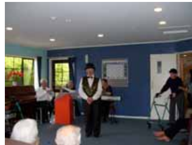
Regency Review Master of Ceremonies

On Friday 17 August at 1.30pm a wonderful troupe called "Regency Review" came to BriarGate to entertain our residents.