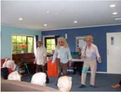
The Three “Bother” Boys

They sang all the really old????? (Flanagan and Allen) songs, such as - Strollin', just Strollin, Underneath the Arches and Doing the Lambeth Walk (I had never heard this song ). They were really fantastic and the residents so enjoyed singing along with the troupe.