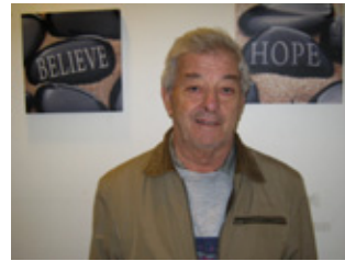
Always with the new paintings behind him

The inner courtyard is also being completely replanted. Landscapers are coming in to plant new, colourful flowers for spring. The colours of the plants were specifically chosen as they have a therapeutic effect on our residents.